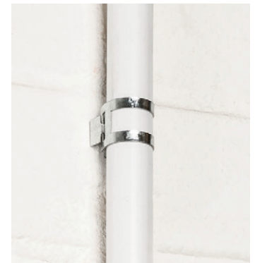
Centralised base fixing, gives a neat appearance to installation

Safe-D Conduit Clips combine fire performance, quickest fix, and a modern look, to secure cables in 20mm & 25mm outer diameter PVC and galvanised conduit installations... or exposed 20mm or 25mm o/d cables and pipes.