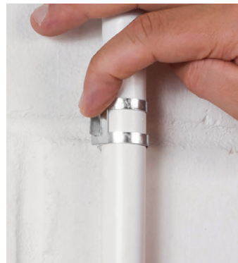
Secure conduit with locking tab