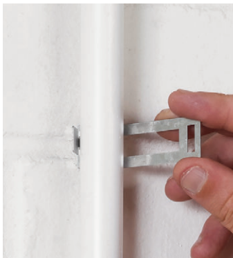
Provides a 3mm stand off from the surface