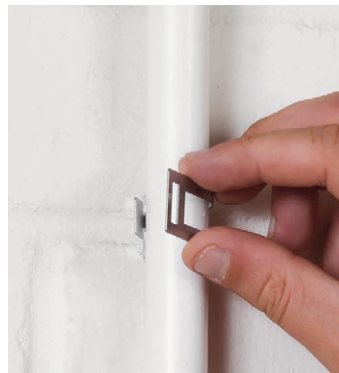
Simply wrap around the conduit, perfect for tight spaces